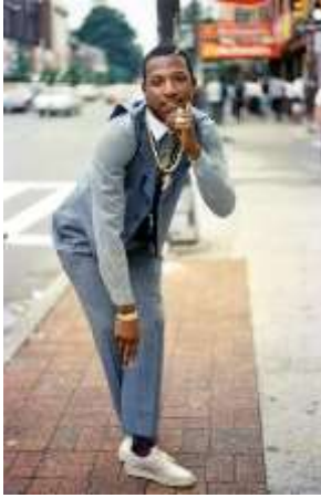
3. Jamel Shabazz, Rude Boy, Brooklyn, NYC, 1981