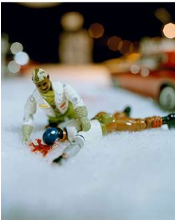
5. Hank Willis Thomas and Kambui Olujimi